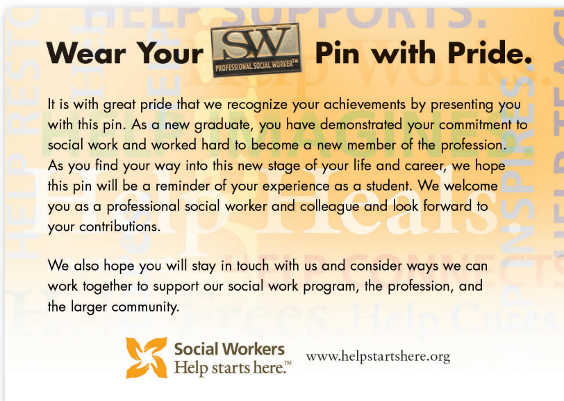
Generic Pin Card

If you would like the pin card personalized with your school logo and the name of the Dean, Field Director, or other school official please complete the form below and mail, fax or scan and email to naswfoundation@naswdc.org along with your school logo.